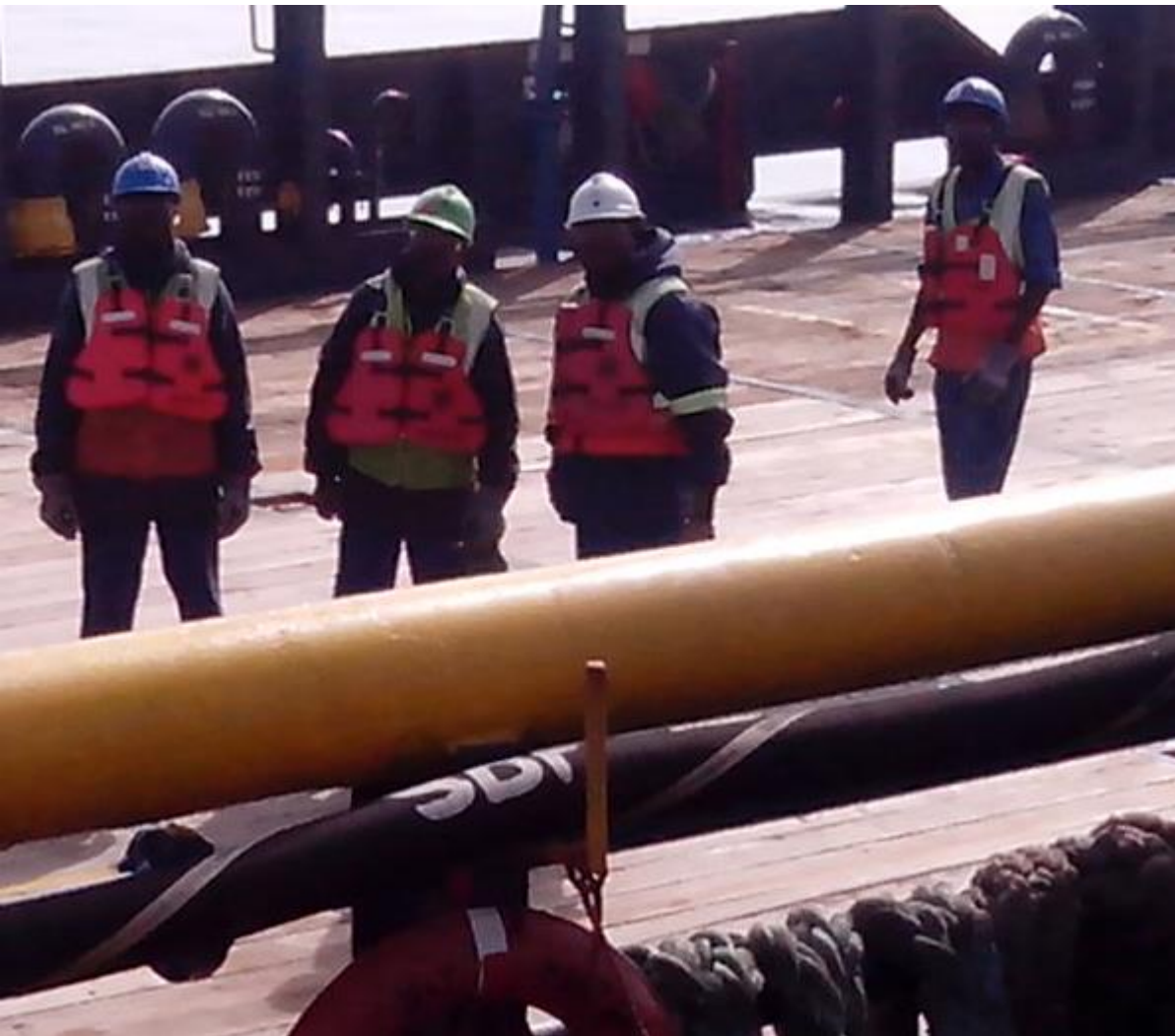
Manica crew members with PFD on Pattarozzi Tide