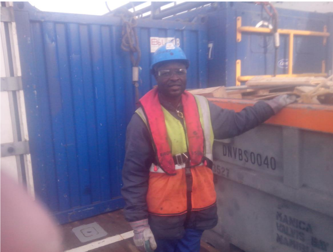
Manica crew member with PFD on Fanning Tide