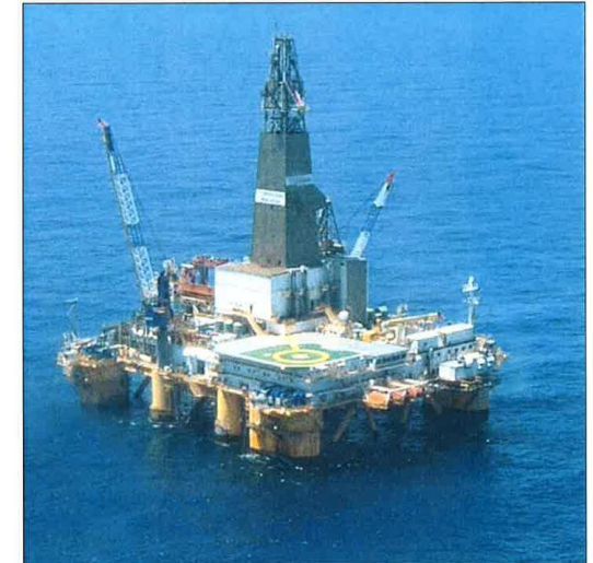
Transocean's Marianas Rig

Welcome to Namibia and to Luderitz. The information contained within this pamphlet is to provide some simple but important guidance for new arrivals and personnel either transiting through or staying overnight in Luderitz. For further details contact the HRT Base Managers in Luderitz.